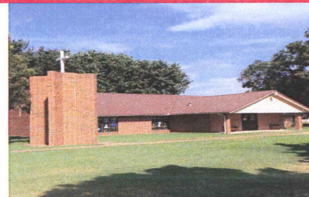
St. Michael Mission

Welcome to the St. Wenceslaus Catholic Church Bienvenidos a la Iglesia Católica de St. Wenceslaus